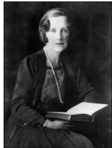
Mary Annette Countess Russell, born Beauchamp, called Elizabeth von Arnim