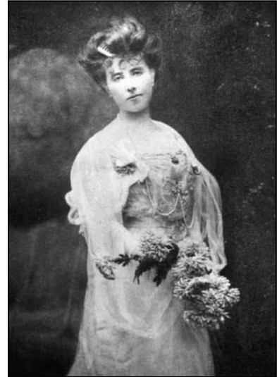
Elizabeth von Arnim, * 1866, † 1941

Her first publication was a novel, "Elizabeth and her German Garden", anonymously published. Since this book was a success right from the start, the following works she signed only "by the author of Elizabeth and her German Garden". Henceforth the autobiographic figure of Elizabeth represented the person herself. The only novel she wrote using a pen name, was "Christine": by Alice Cholmondeley. Only recently she became known in Germany by the name of Elizabeth von Arnim, since her publications between 1898 and 1940 now are again published under that name. This also applies to books written after 1916, the year of her marriage to Francis Russell, Viscount of Amberly.