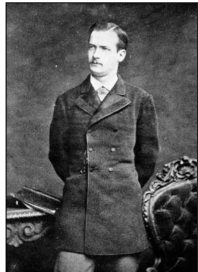
Henning Count von Arnim, * 1851, † 1910