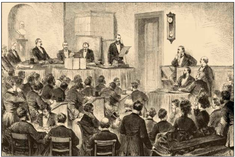
The Arnim court proceedings. Reading of the accusal by attorney Tessendorf

in this way, too. Fritz Münch concluded that "why the reading out of about sixty papers in court and thus opening them to the public does not make a lot of sense when looking at the actual results of the proceedings". Münch continues "but the purpose of the proceedings was political, too, in the end - therefore some documents were well-suited to disgrace Arnim. Some of them were also used to assess Arnim's credibility"<sup>20</sup>, i.e. to debase him.